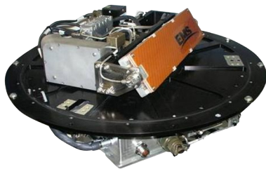
Standard directional antenna