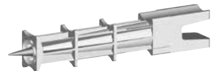
EM Railgun Compatible HVP

BAE Systems, Inc. Platforms & Services www.baesystems.com