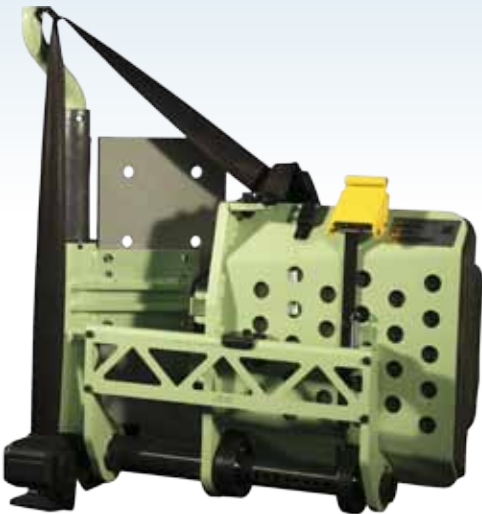
Maximize space by folding forward, backward and against vehicle wall

The seat maximizes space claim by folding forward, backward and against the vehicle wall to aid in ingress, egress and accessibility to all vehicle areas. The seat also features a fore/aft adjustment, removable seat cushions and waterproof fabric.