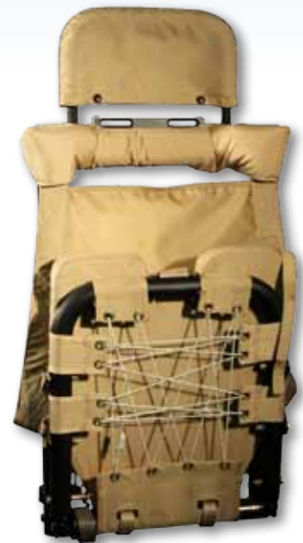
Automatic stowing, flip-up seat pan aids in egress and maneuverability

*Through efforts like the SMT 2000, BAE Systems is dedicated to providing distinctive solutions that maximize operational effectiveness through the Science of Survivability.