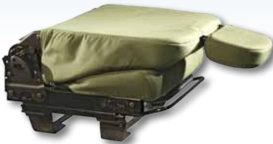
The SMC 2000 folds forward to allow for ease in storage and maneuverability