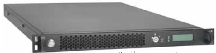
Provides secure remote access between two segregated networks

BAE Systems' Cybersecurity Products offers an access solution that bridges the highest and lowest trust levels to enable secure remote work environments across networks. The Secure Browse-Down Gateway (SBD) utilizes Field Programmable Gate Array (FPGA) enforced security functions to provide protocol breaks and only transmits the necessary data between networks. It enables information exchange across network boundaries while maintaining confidentiality, integrity, and availability of separate networks.