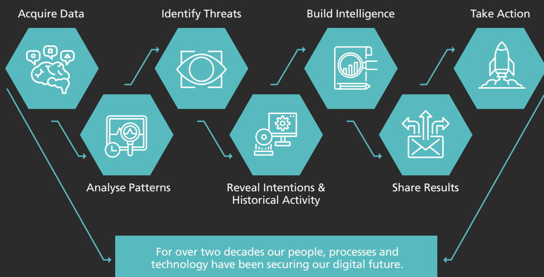
Figure 1: The Digital Chain of Intelligence Generating Activity