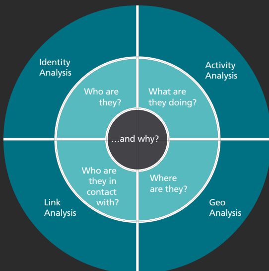
Figure 4: Helping analysts answer investigative questions

A full and unified intelligence picture minimises intelligence gaps. The simultaneous assessment of events from multiple sources can help to establish causality and increase confidence in the quality of the intelligence, allowing it to be cross-referenced and corroborated.