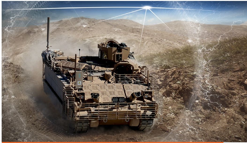
MPE-M is in operational use and currently deployed worldwide.

At its core, the M-Code signal increases MPE-M's mission-effectiveness, while maintaining standard SAASM functionality.