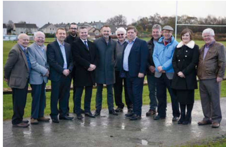
The local community will benefit from the development