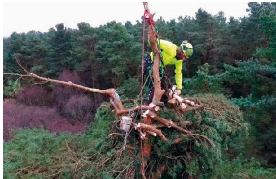
The platform aims to attract the majestic bird