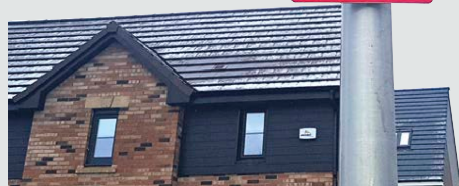
One of the winning speed awareness signs