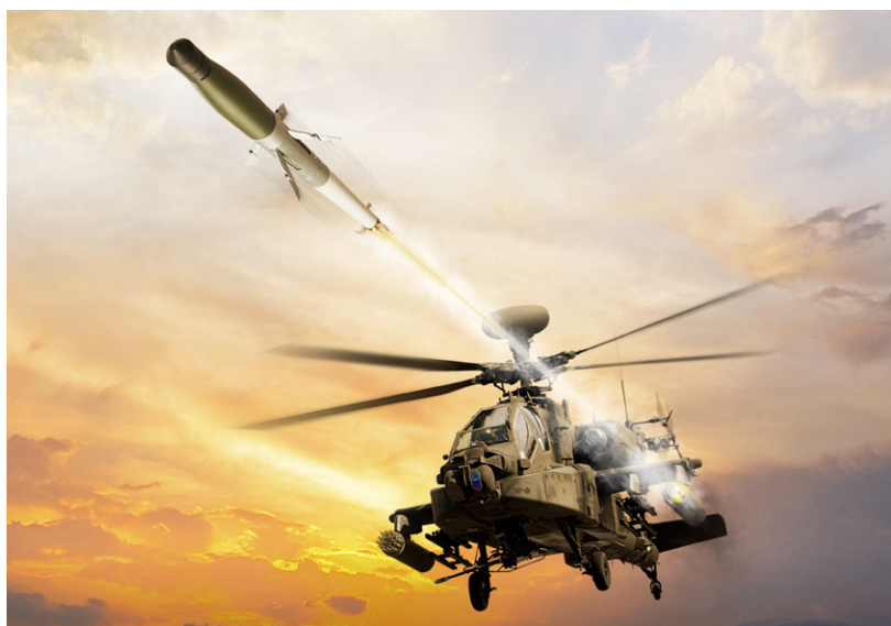
The APKWS rocket successfully operates in combat on the AH-64D/E , MH-60R/S , UH-1Y , and AH-1W as well as other rotary-wing and fixed-wing platforms.

Our rocket consistently hits its target, with over a 93 percent success rate in combat operations. It has achieved this success with the U.S. Navy and U.S. Marine Corps since 2012. The rocket is also utilized by the U.S. Army on the AH-64 Apache, with numerous confirmed successful engagements in combat.