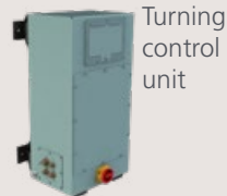
Turning control unit