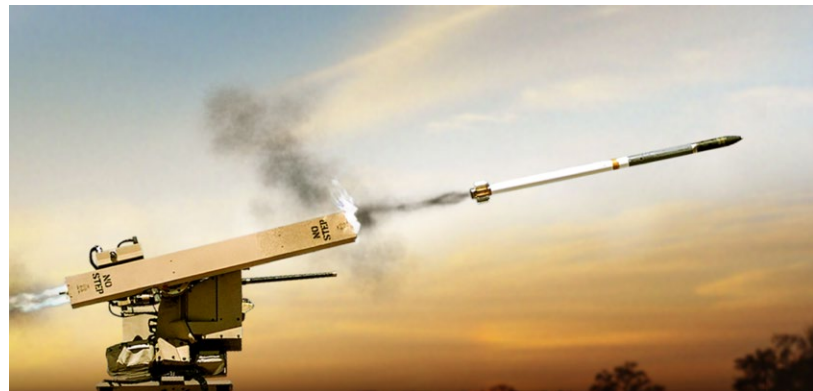
An APKWS laser-guided rocket fires from a ground-based containerized weapon system during test fires.

The APKWS guidance kit is a fraction of the price of alternative ground-launched precision munitions. While some modifications are required for ground-based systems, no major platform modifications are needed for FW and RW aircraft, and only minimal training is required. We are currently qualifying on ground-based systems and our guidance kit is available today to U.S. allies via the Foreign Military Sales process.