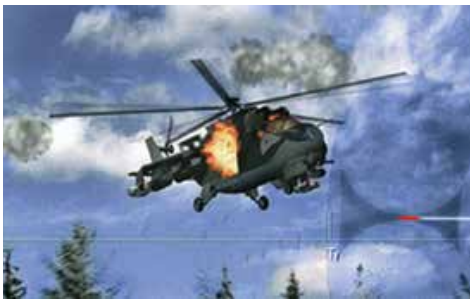
Gated Proximity with Impact Priority