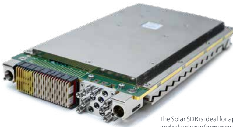
The Solar SDR is ideal for applications that require high channel density and reliable performance at a more affordable price per channel.