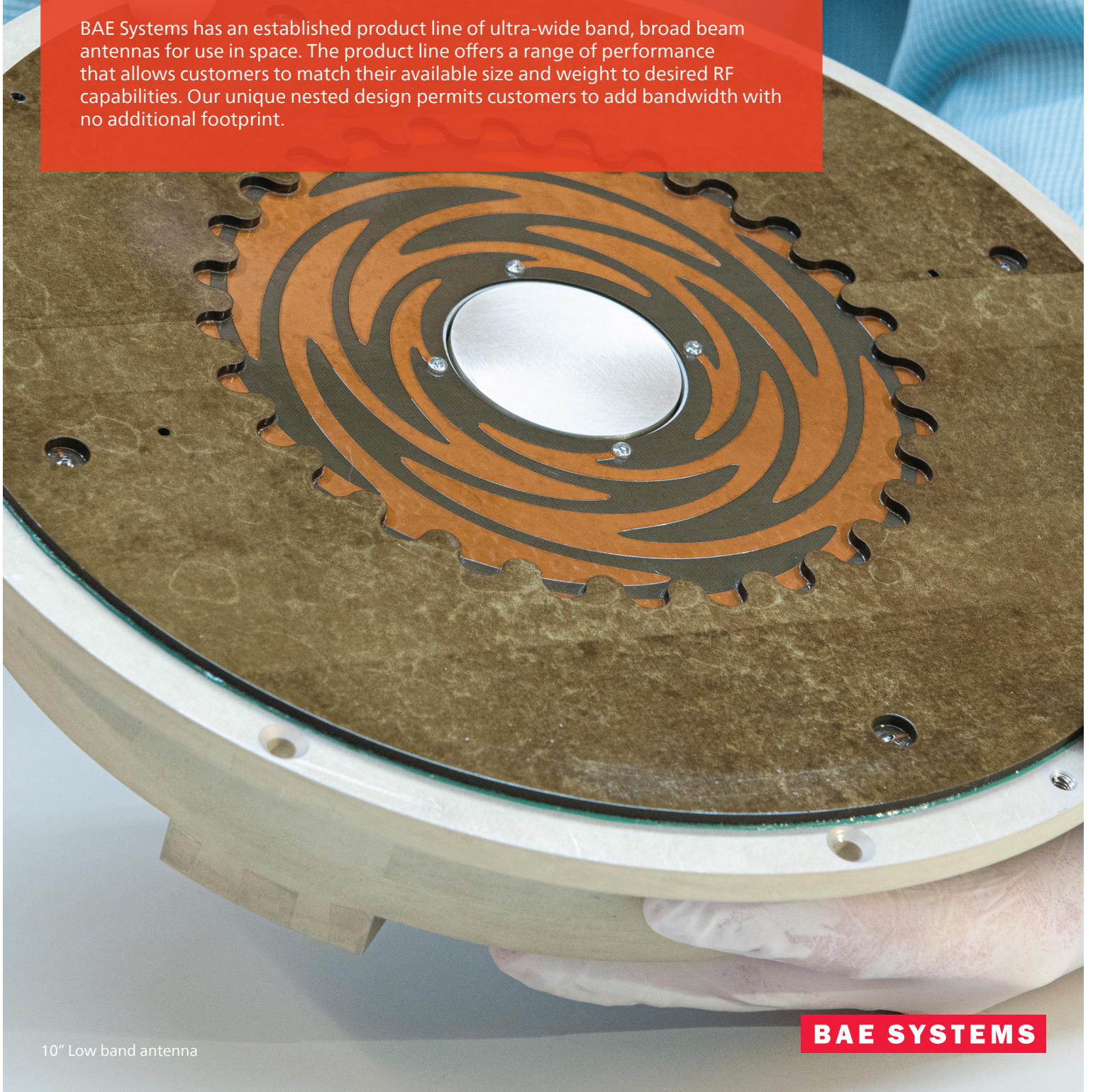
10" Low band antenna

BAE Systems has an established product line of ultra-wide band, broad beam antennas for use in space. The product line offers a range of performance that allows customers to match their available size and weight to desired RF capabilities. Our unique nested design permits customers to add bandwidth with no additional footprint.