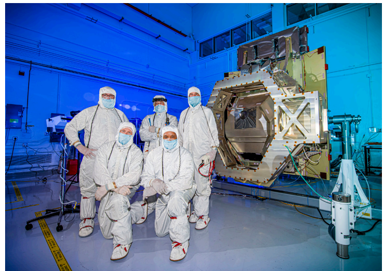
Roman team next to integrated the Wide Field Instrument