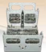
Infrared Countermeasures Dispensers