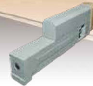
Radio Frequency Countermeasures Canister