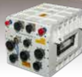
Countermeasures Controller (CMC)