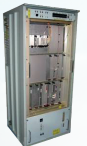
New improved signal processor, plot and track extractor