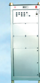
Current signal processor