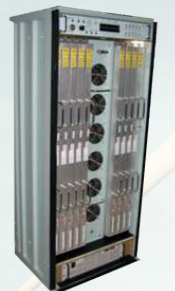
New improved transmitter