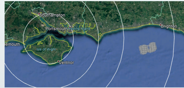
Cowes-based Watchman reference radar performance against Rampian wind farm

The Watchman radar update will deliver high performance even in the presence of wind farms.