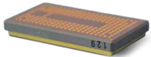
Pre-production 1Gb SRAM in side-by-side two die format

Capable of withstanding the effects of natural space and an upper radiation hardened environment, the monolithic SRAM DDR3L SDRAM has a total-dose tolerance of greater than 300Krad and an upset rate of less than 1E-12 upsets per bit-day.