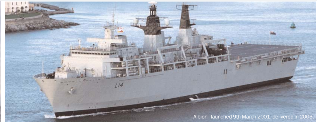
Albion - launched 9th March 2001, delivered in 2003.