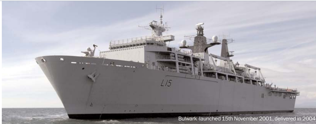
Bulwark - launched 15th November 2001, delivered in 2004.

Transport of large Embarked Military Force (plus support equipment) across open oceans. Delivery or retrieval of in excess of 60 vehicles plus trailers, or equivalent weight in stores. Vehicles up to Main Battle Tank size can be carried. Support of flexible landing on hostile shores using the onboard helicopters and landing craft. The LPD(R) features a large floodable stern dock with gate, side ramp access and a large flight deck. Co-ordinating amphibious operations through integrated Command, Control and Communications facilities.