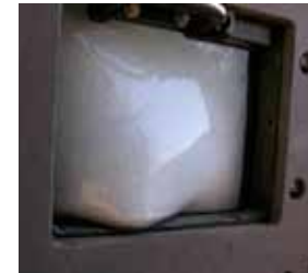
HMMWV window hit by IED – exterior and interior