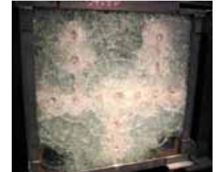
ALON test panels