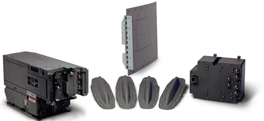
AN/APX-113(V) CIT system

Dual-redundant MIL-STD-1553 bus interface